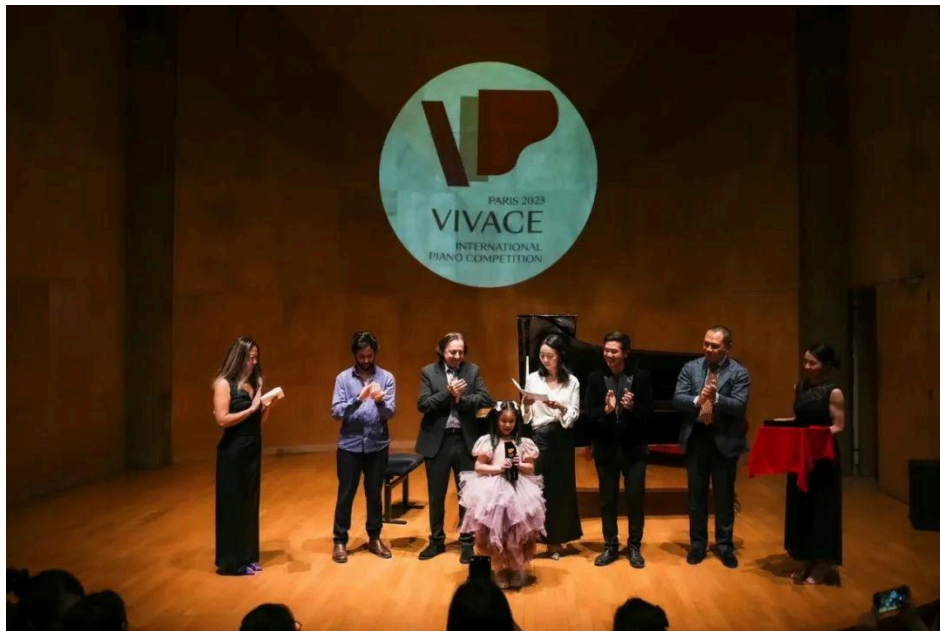
The award-winning young musicians from New Zealand

After the competition, the candidates not only were very lucky to have the guidance from the judge, but also had a week of study in Paris, a rare learning opportunity and a high-quality platform, and the pianists had a great deal of satisfaction.